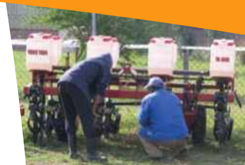
Gearing up for planting