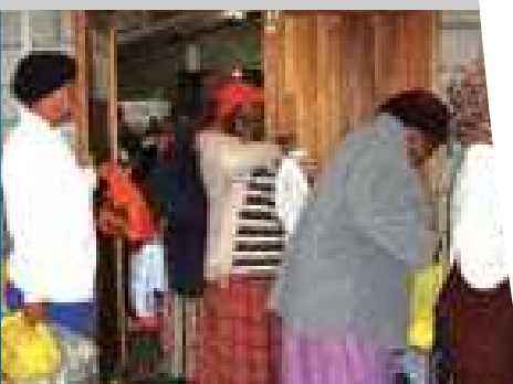
The feeding programme makes food available to the community on Tuesdays