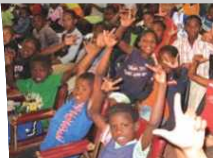
Children's Church meetings on Friday