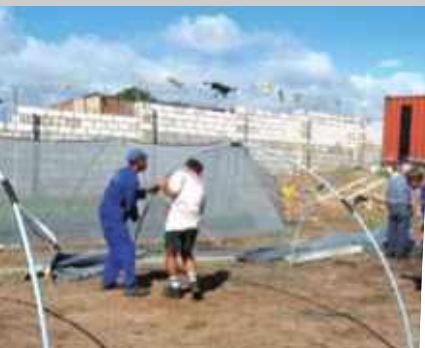
Tunnels being erected for the vegetable growing project