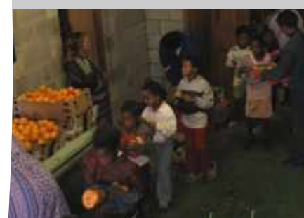
The children receiving fruit after the children's church meeting