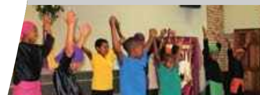
Dance performance by children from the children's church