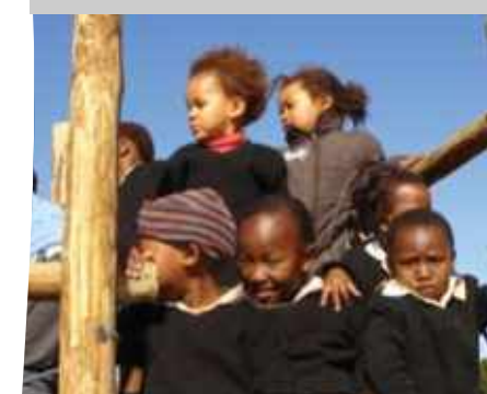
The Vukukhanye children hard at play during break time