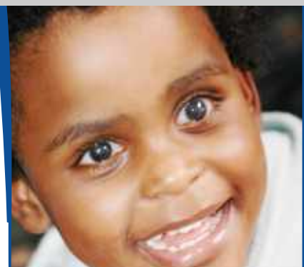
Baby Odette after a miraculous recovery