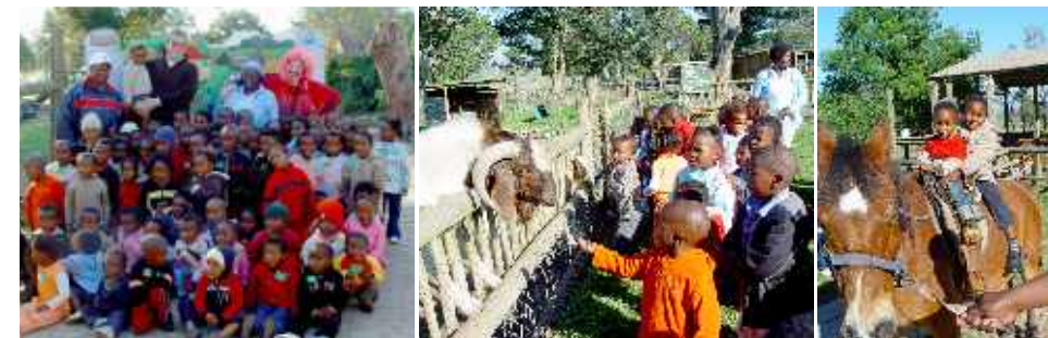
The 2006 outing to Holmeleigh Farm with the children and workers of Ilitha, facilitated by Sovereign staff.