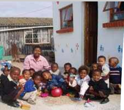
The children of the Vukukhanye Pre-School with one of the care givers.