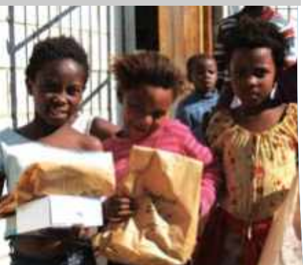
Children receiving food hampers after children's church meetings