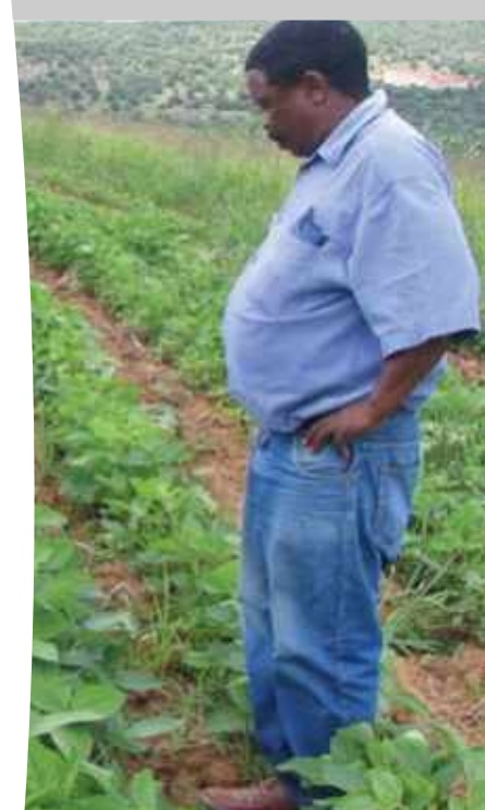
Inspecting the early stages of the crop