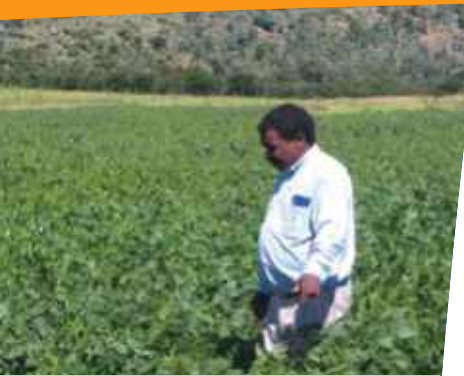
Sisa inspecting the soya crop

The various agricultural projects run by the SDF has sparked wide spread interest in the surrounding areas and many similar projects are springing up in the region, boasting well for the future of agriculture in Keiskammahoek. The Siyakholwa Development Foundation would eventually like the farmers to become self sufficient with the SDF adopting the role of a central buying organisation and marketing hub to the farmers until such time that they are able to establish themselves as successful independent commercial farmers.