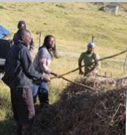
Thrashing the soya by hand after harvesting