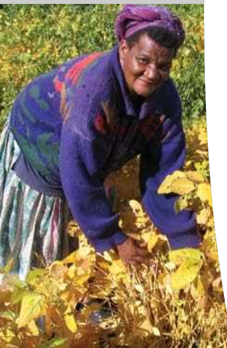
Checking the soya crop just before harvest time